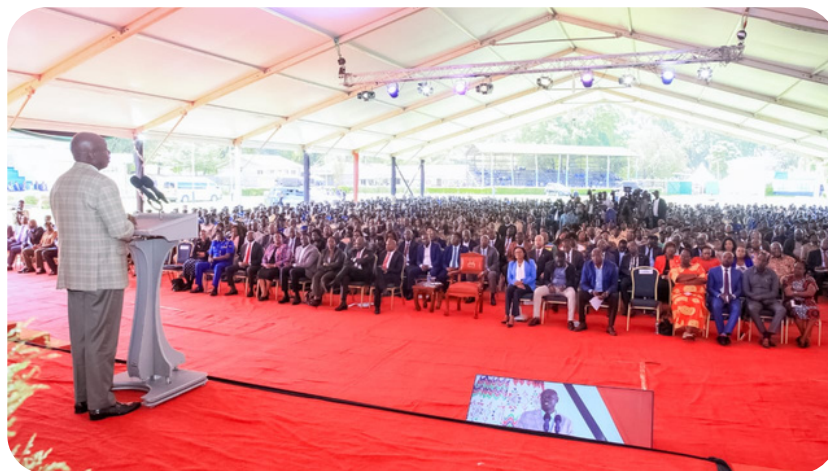
The Deputy President of the Republic of Kenya, H.E Rigathi Gachagua addressing a host of government and law enforcement officers in a conference aimed at ending alcoholism and drug abuse in Nakuru on the 29th of May.