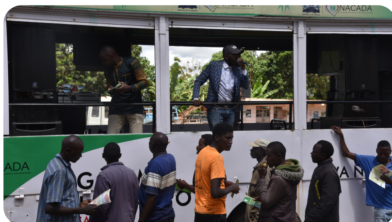
Residents of Ishiara town in Embu County, pay close attention to the MC while also receiving support materials during one of the roadshow days